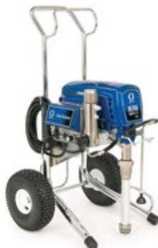
Graco UltraMax 695