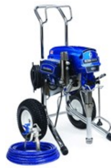
Graco UltraMax 1095