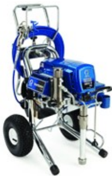
Graco UltraMax 795